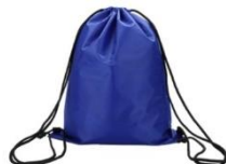
Draw string P.E. bags in the Godrevy colours, which can be purchased with printed logo.