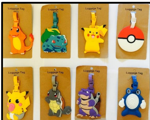
To safeguard all children, we ask that names are not embroidered or printed onto bags. We prefer the use of identifiable keyring is used. This will help your child find their bag - but will reduce potential dangers.