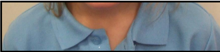
Enys Polo Shirt