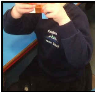
Dark navy school sweatshirt or cardigan. To be worn with black trousers, shorts, skirt or pinafore dress.