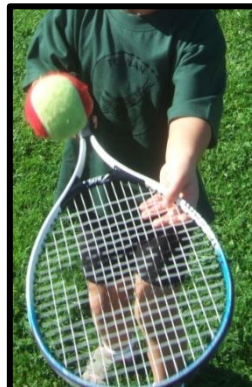
Enys, Porth and Towan P.E. T-shirts. (We no longer request the t-shirt has a logo printed on it) Worn with black shorts or joggers (for cold weather).