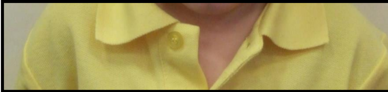
Porth Polo Shirt