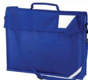
School book bags available in the Godrevy Group colour, again with printed logo if wished.