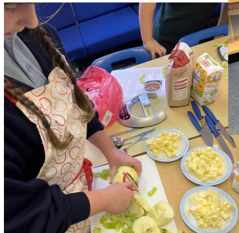
Some pictures from a couple of our after school clubs this week.